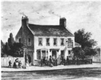
Yorkshire Stingo Tea Garden

To learn more about the Lost Tea Gardens of London follow the link posted in the Web sites of Interest list.